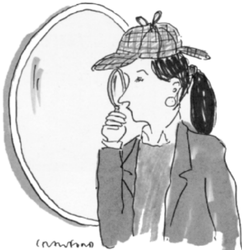
The professional who reasons productively casts a critical eye on her own role in a company's problem.

First, the consultants would have demonstrated their commitment to continuous improvement by being willing to examine their own role in the difficulties that arose during the consulting project. No doubt they would have identified their managers and the clients as part of the problem, but they would have gone on to admit that they had contributed to it as well. More important, they would have agreed with the manager that as they explored the various roles of clients, managers, and professionals, they would make sure to test any evaluations or attributions they might make against the data. Each individual